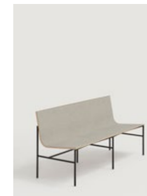
465P Upholstered bench with oak shell and solid steel structure