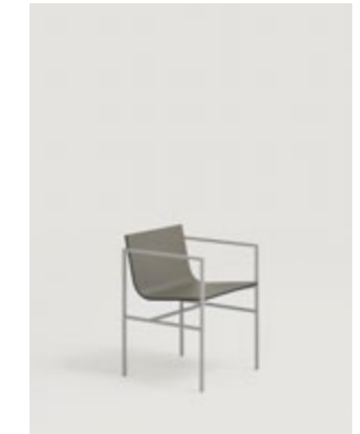
462R Oak wood armchair with solid steel structure