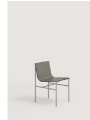
460R Oak wood chair with solid steel structure