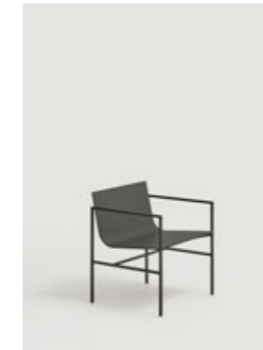
464R Oak wood lounge chair with solid steel structure