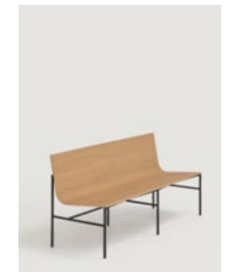
465R Oak wood bench with solid steel structure