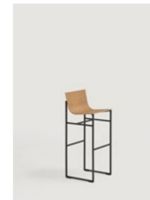
469R Oak wood stool with solid steel structure