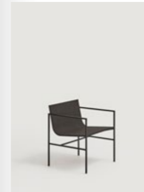
464P Upholstered lounge chair with oak shell and solid steel structure