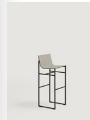
469P Upholstered stool with oak shell and solid steel structure