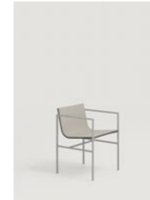
462P Upholstered armchair with oak shell and solid steel structure