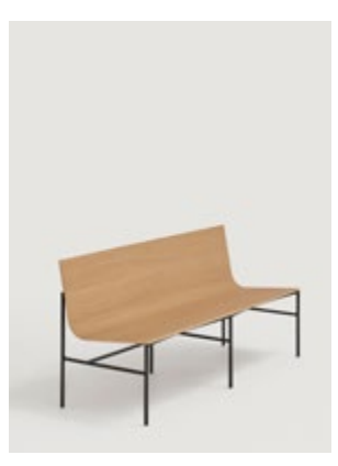
465R Oak wood bench with solid steel structure