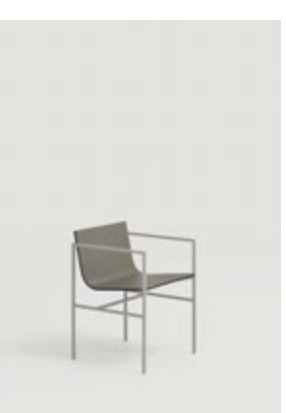
462R Oak wood armchair with solid steel structure

Upholstered armchair with oak shell and solid steel structure