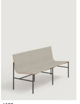
465P Upholstered bench with oak shell and solid steel structure