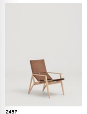
Lounge chair with beech wood frame. Handcrafted upholstery with suede leather