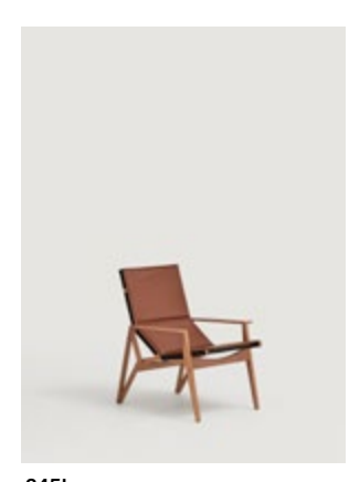
Lounge chair with beech wood frame. Upholstered using sailcloth, foam and fabric or leather